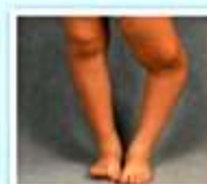
Limb Length Discrepancy

Will your child benefit from seeing a pediatric orthopaedic specialist?