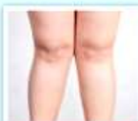
Knee & Hip Problems