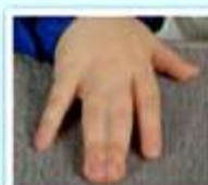
Finger & Hand Problems