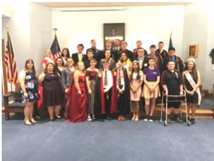
"Delaware Chapter, Order of DeMolay Installation of Officers, August 10th, 2019"